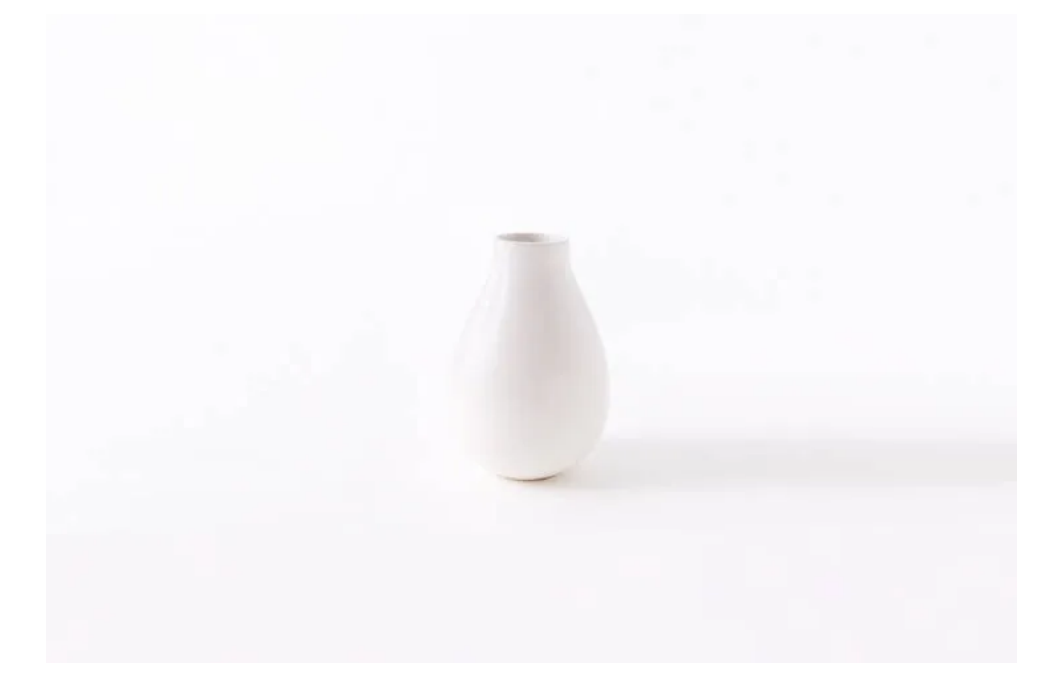
Above: The Pure White Ceramic Vase in Small Raindrop is $36 from West Elm.