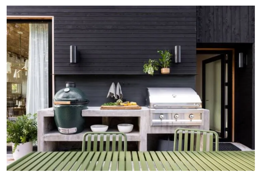
Above: The custom outdoor kitchen was designed by Jocie and built by Shugart Builders.

living spaces: a lounge area, an outdoor kitchen and dining area, and a fire pit. Fortunately, Jocie notes, the deck was completed before the price of cedar skyrocketed.